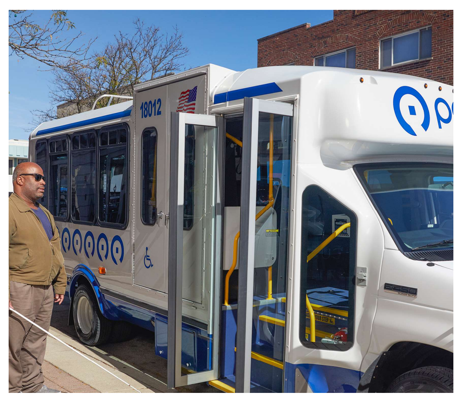
PROGRAM SPONSORED BY